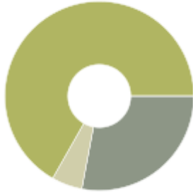
Scope 2 Market-Based Energy