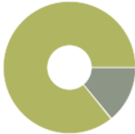
Scope 2 Market-Based Energy