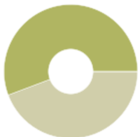
Scope 2 Market-Based Energy