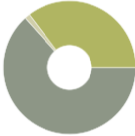
Scope 2 Market-Based Energy